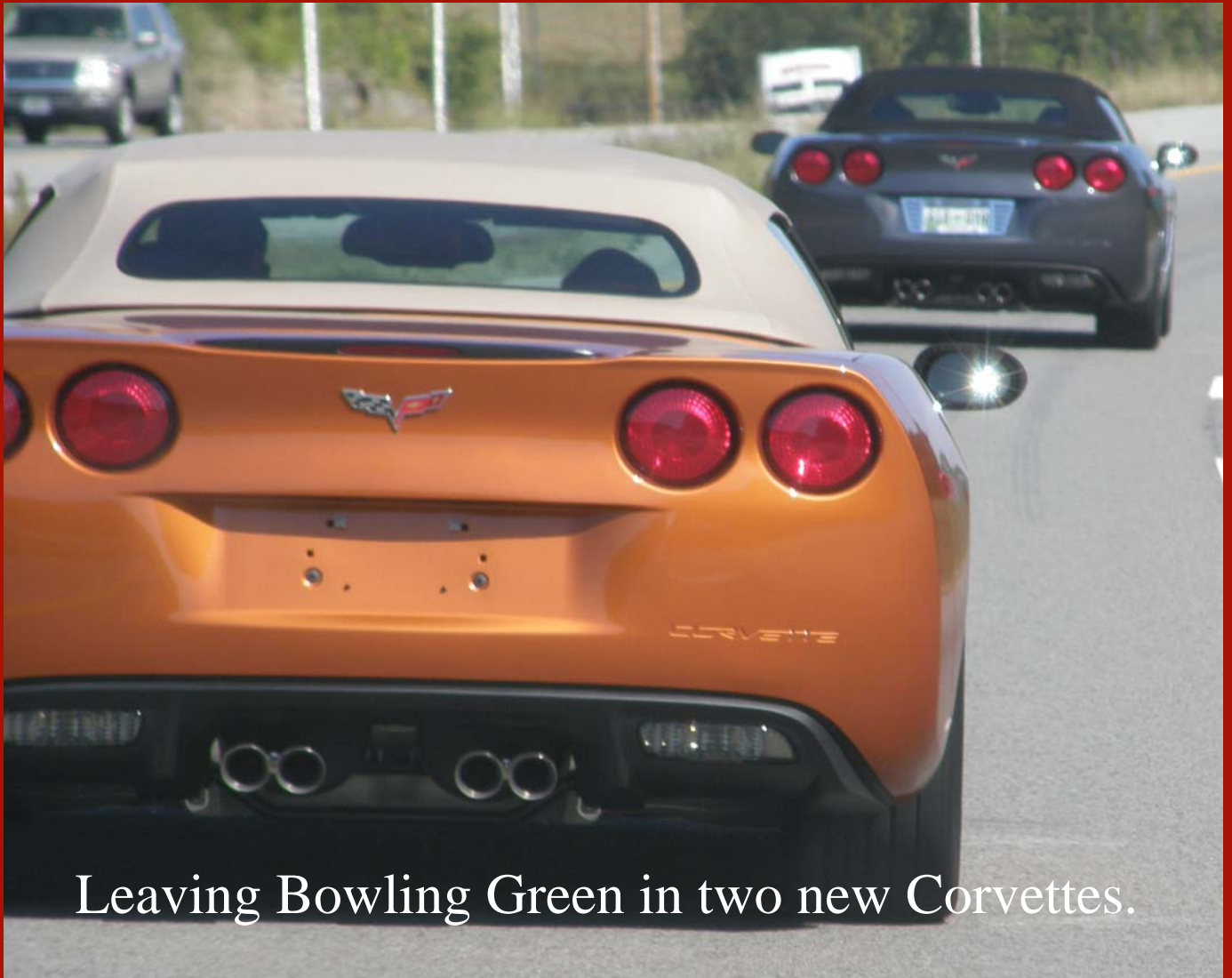
Leaving Bowling Green in two new Corvettes.