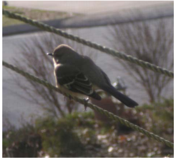
Mockingbird, waiting for its' next victim.